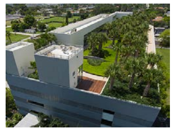
Fig. 2 EGR, Bridgepoint Active Healthcare, Toronto, ON (left), IGR, Aventura Optima Plaza, Aventura, FL (right)

Intensive Green Roofs may require irrigation during dry periods having a thicker soil layer than extensive ones. Because of their thicker soil, these roofs require greater structural support (Fig. 2. right). IGR allow a greater variety and size of plants such as shrubs and small trees but have higher initial costs and maintenance.